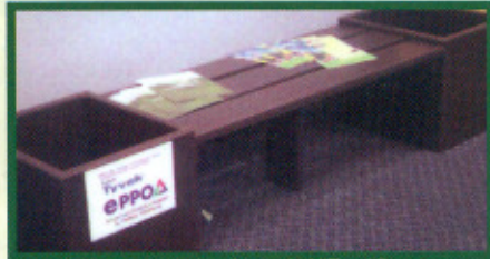
A bench made of recycled "Tyvek" bunnings by Dupont (M) Sdn. Bhd.