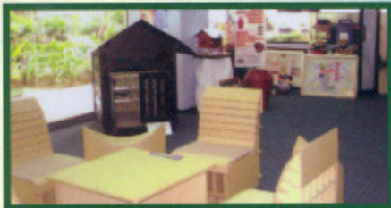
Furniture made of boxes by Ornapaper Industries (M) Sdn. Bhd.