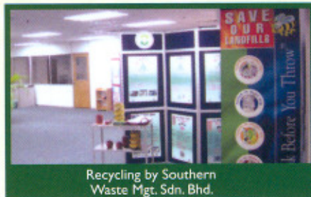
Recycling by Southern Waste Mgt. Sdn. Bhd.