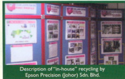
Description of "in-house" recycling by Epson Precision (Johor) Sdn. Bhd.