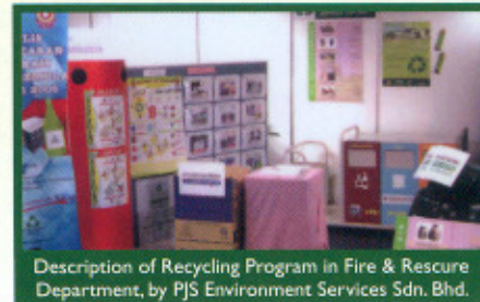
Description of Recycling Program in Fire & Rescue Department, by PJS Environment Services Sdn. Bhd.

Kindly contact the "Recycling Secretariat" at 603-2094 5454 603-2099 2370