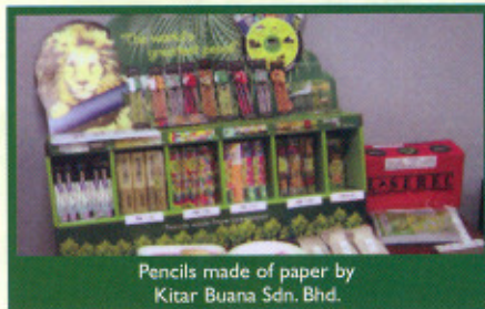
Pencils made of paper by Kitar Buana Sdn. Bhd.